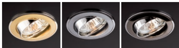
art. 70005 PG/S Pearl Gold/Silver