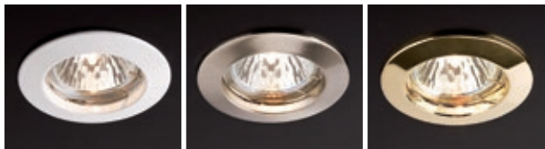
art. 70008 WH White