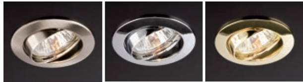
art. 70081 NM Nickel Mat