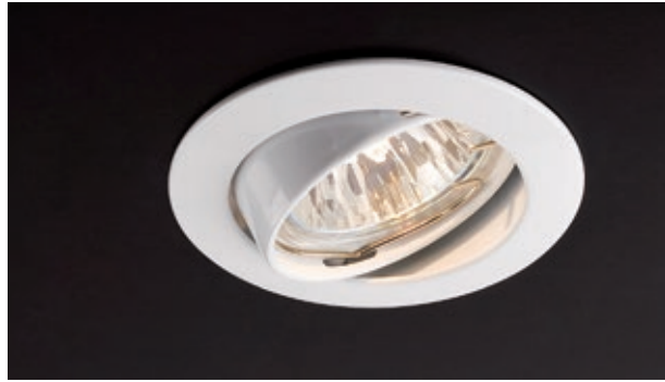
art. 70001 WH White