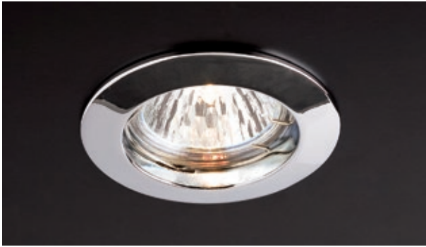
art. 70009 CH Chrome