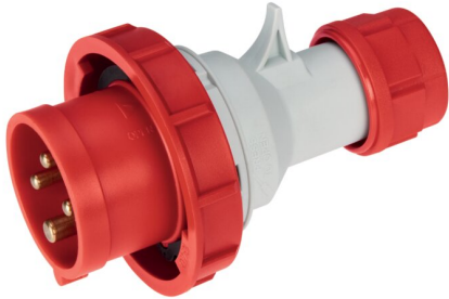
IMMAGINE RAPPRESENTATIVA EC REPRESENTATIVE IMAGE

Industrial > Plugs and sockets > Portable > Plugs > Cee plug (iec 60309) > Ip67 - 32 a