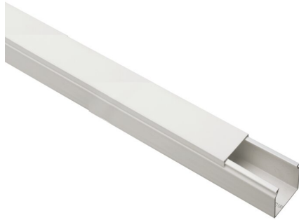
IMMAGINE RAPPRESENTATIVA EC REPRESENTATIVE IMAGE

Trunkings > Wall and ceiling > Solid cable trunkings > Series cp - trunking lengths > Cable trunkings > Din pitch trunkings