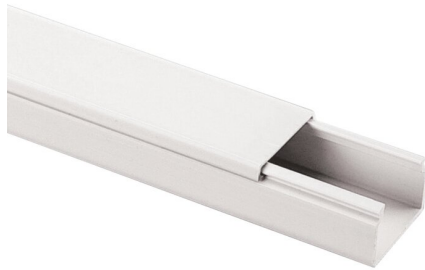
IMMAGINE RAPPRESENTATIVA REPRESENTATIVE IMAGE

Trunkings > Wall and ceiling > Miniature solid trunkings > Series mc - front lid > Mini/maxi trunkings > White