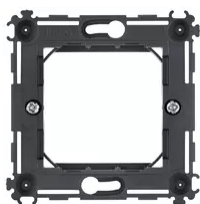
09602.1 - Frame 2M +claws 71mm