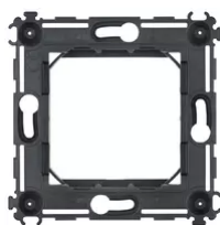
09603.1 - Frame 2M without screws 71mm