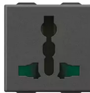
09257.CM - 2P+E13ASICURY multistandard outlet carbo