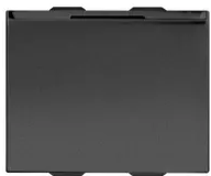
09463.CM - Vertical badge switch 2M carbon matt