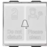
09097 - Pushbutton +2 Hotel indicators 230V