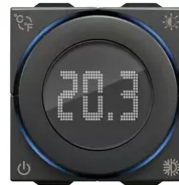
09470.CM - Dial thermostat 100-240V 2M carbon m