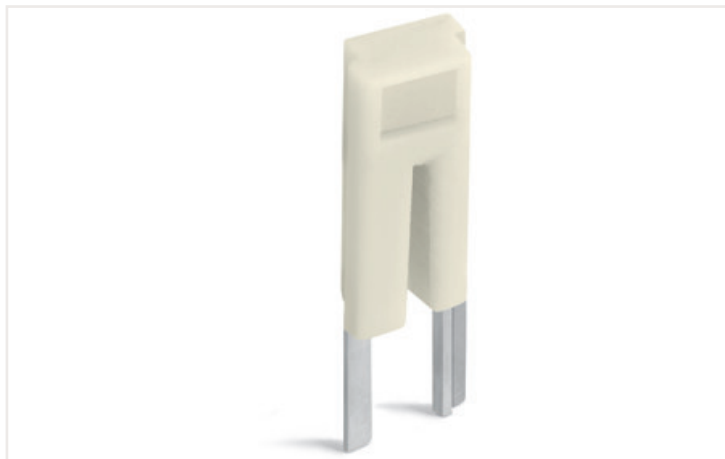
Цвят: ■ светло сив