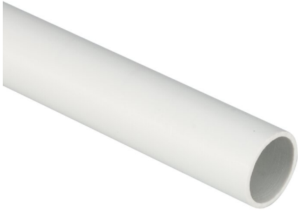
IMMAGINE RAPPRESENTATIVA EC REPRESENTATIVE IMAGE

Conduits and fittings > Conduits > Rigid conduits > Series tg15 - pvc - class 33211 - 750 n > plastic conduits > 2 meters - length