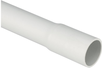
IMMAGINE RAPPRESENTATIVA REPRESENTATIVE IMAGE

Conduits and fittings > Conduits > Rigid conduits > Series tg12 - pvc - class 22211 - 320 n > plastic conduits > 3 meters - length - bell end