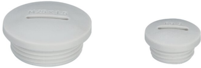
IMMAGINE RAPPRESENTATIVA REPRESENTATIVE IMAGE