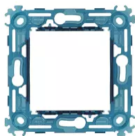
19603 - Frame 2M without screws 71mm