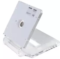
40595 - Tab 5 Up desktop