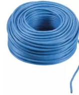
732H.E.500 - 2F+ PVC-cable internal laying Eca 500m