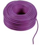
732I.C.100 - 2F+ cable 2x1 LSZH Cca 100m purple