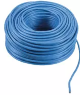
732H.E.100 - 2F+ PVC cable 2x1 intern.laying Eca 100m