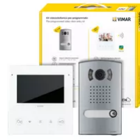
K40515.E - Video kit 1-Fam.Tab 5S Up Wi-Fi +1300E