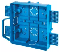
40590 - Box for Tab5 Up video entryphone