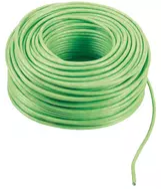
732I.E.500 - 2F+ LSZH cable 2x1 ext. laying Eca 500m