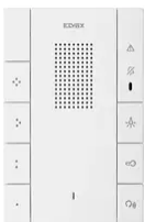
40547 - Voxie interphone 2F+ 7-button white