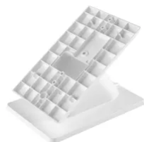
40598 - Voxie desktop white