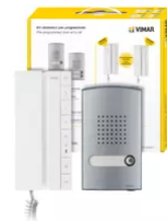
K40542.E - Entryphone kit 2F+ 1-fam. 40542+40141