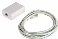
753B - Interconnecting bullen nail table base