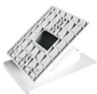
753A - Table box for Tab white