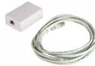
753B - Interconnecting bullen nail table base