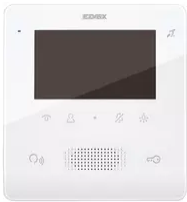
7559 - Video entryphone Tab Free 4.3 2F+ white