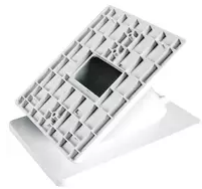
753A - Table box for Tab white