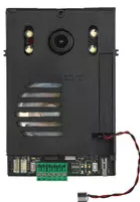
40135 - Audio/Video unit 2F+