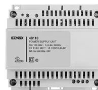
40110 - Supply unit 2F+ 100-240V 1 OUT 1,6A