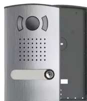
40151 - Audio/Video color entrance panel 1Fam.