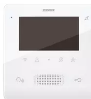
7558 - Video entryphone Tab Free 4,3 2F+ white