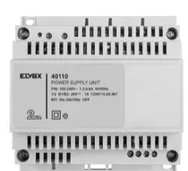
40110 - Supply unit 2F+ 100-240V 1 OUT 1,6A