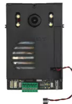
40135 - Audio/Video unit 2F+