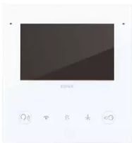
40515 - Tab5SUp video entryphone 2F+ Wi-Fi whit