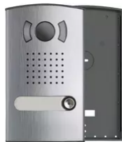
40151 - Audio/Video color entrance panel 1Fam.