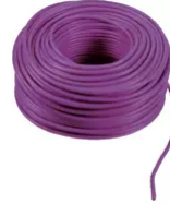
732I.C.100 - 2F+ cable 2x1 LSZH Cca 100m purple