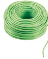
732I.E.100 - 2F+ LSZH cable 2x1 outer laying Eca 100m