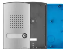
40141 - 1-family audio entrance panel