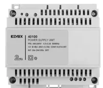
40100 - Interphone supply unit 2F+ 100-240V 0,6A