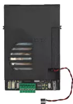
40131 - Audio electronic unit 2F+