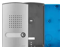
40141 - 1-family audio entrance panel