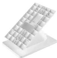
40598 - Voxie desktop white