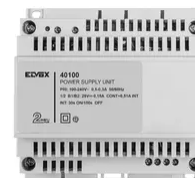
40100 - Interphone supply unit 2F+ 100-240V 0,6A