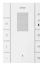
40547 - Voxie interphone 2F+ 7-button white