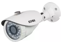
46CAM.136B.8 - Bullet IR AHD cam1080p 3,6mm lens CVBS