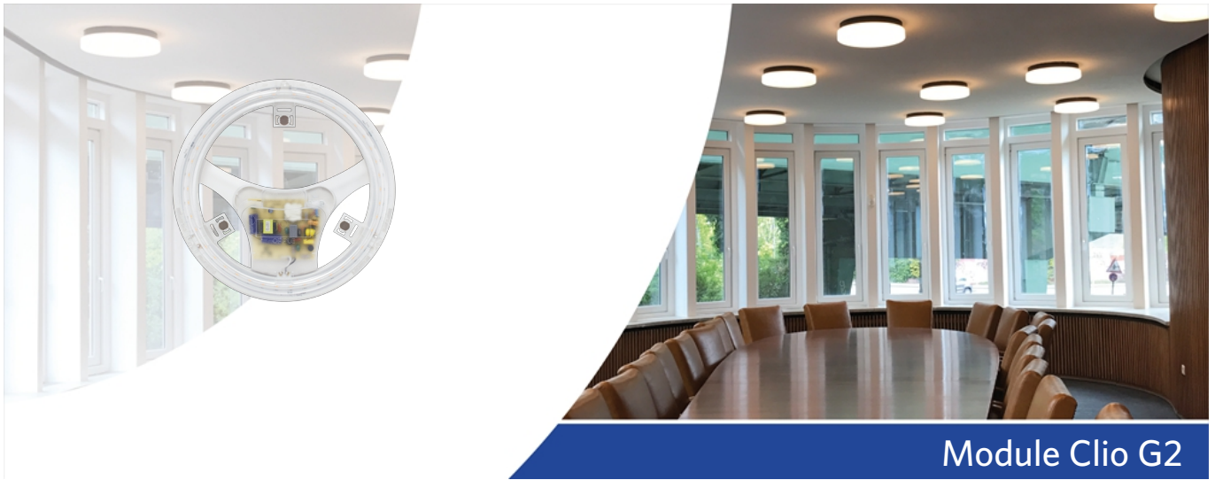
Module Clio G2