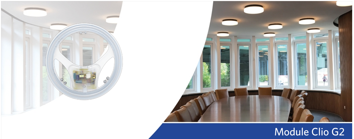
Module Clio G2