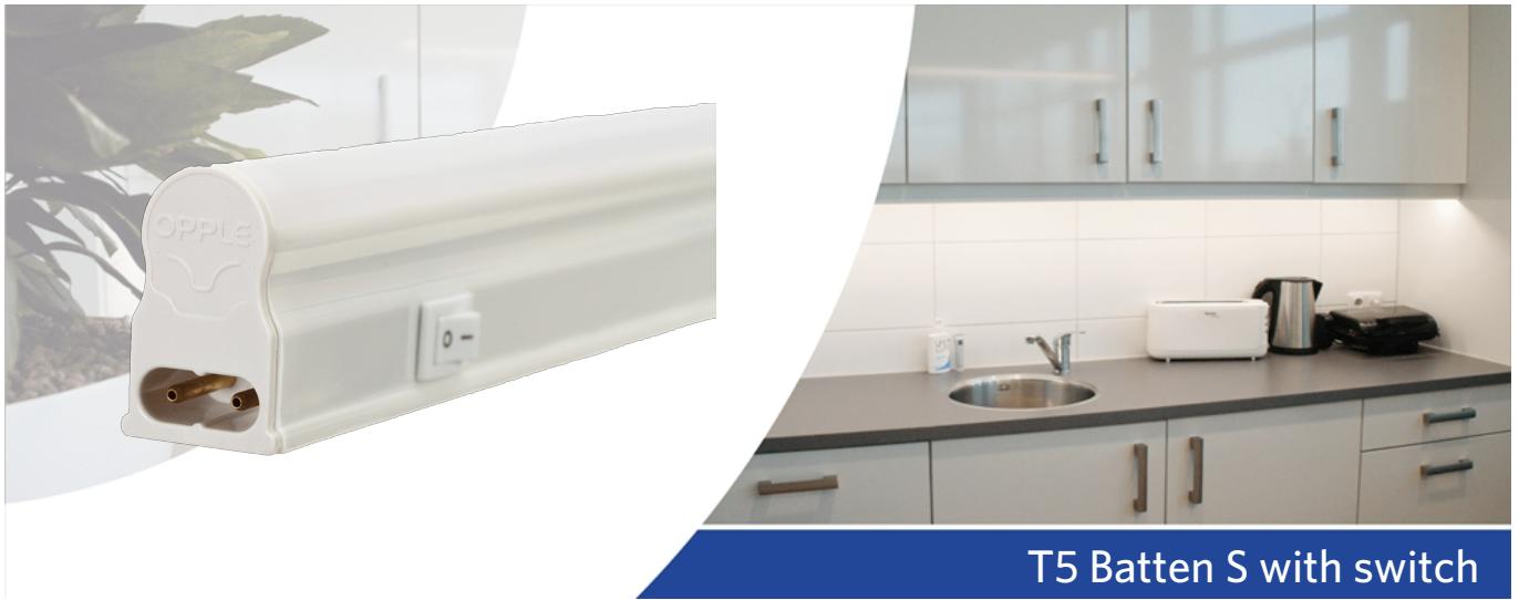
T5 Batten S with switch