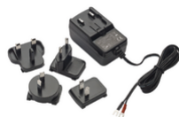
40104 - Supply unit 100-240V~24Vdc 1A EU UK AU US