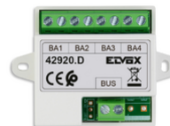
42920.D - Bus distributor 4 outs Video RFID kit