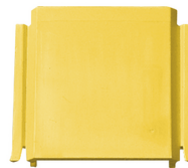
V70191 - Joint plate for junction boxes yellow