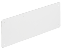
V70109 - High-resistance cover for V70009