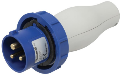
IMMAGINE RAPPRESENTATIVA EC REPRESENTATIVE IMAGE

Industrial > Plugs and sockets > Multiple way connectors and adaptors > Plug-socket adaptors > Cee socket outlet combination (iec 60309) > Series klect - schuko sockets to cee