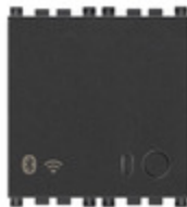
19597 - IoT connected gateway 2M grey