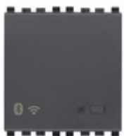
20597 - IoT connected gateway 2M grey