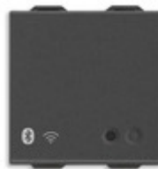
09597.CM - IoT connected gateway 2M carbon matt