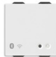
09597 - IoT connected gateway 2M white