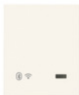
30807.B - IoT connected Gateway 2M white