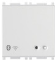
14597 - IoT connected gateway 2M white