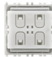
03905 - ZigBee Green Power device