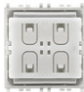
03955 - EnOcean RF device