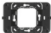
20507 - Frame for RF device grey