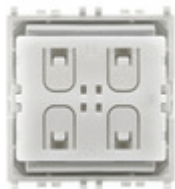
03906 - Zigbee Friends of Hue RF switch