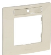
PLATE NILOÉ - 1-GANG - WITH LABEL-HOLDER - IVORY